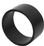
SL RS buis